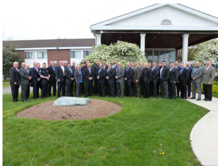
The most recent Command Training Series: First Line Supervisor class pictured here at the Institute graduated on May 5, 2017 and consisted of 38 police supervisors representing police departments from Massachusetts, New Hampshire, Rhode Island, and Vermont.

Director – Justice System Training & Research Institute