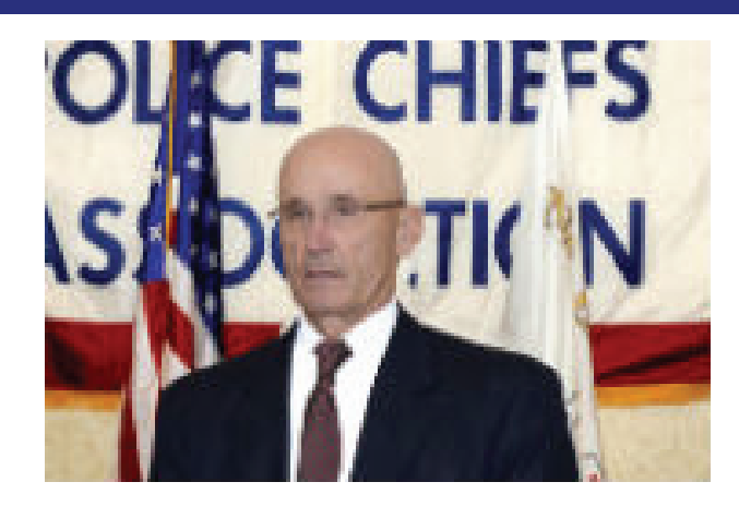
JUNE 27, 2019

The annual conference is sold out (hotel rooms). It is scheduled from October 26-29, 2019 in Chicago. The IACP also is the proud leader in the "Plus One" campaign where we are asking each member to bring at least one member annually. Currently the membership is over 30,000 members across 150 countries worldwide.